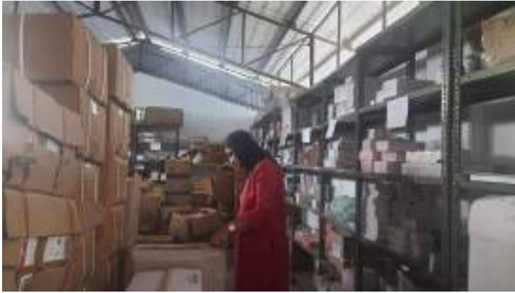
स्वास्थ्य कार्यालय पर्वत स्टोर व्यवस्थापन सुपरिवेक्षण