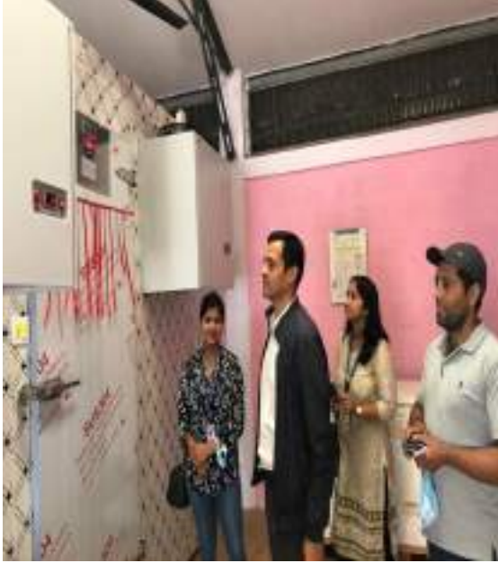
बाग्लुङ स्वास्थ्य कार्यालय स्थित कोल्डरूम मा रहेको Walk nin Cooler संचालनमा रहेको समस्या बारे जानकारी लिँदै