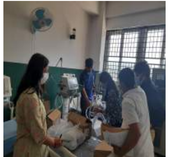
पर्वत अस्तालमा खरीद गरिएका Equipments हरूको post shipment inspection