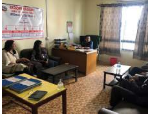
पर्वत अस्पतालमा बायोमेडिकल उपकरण संचालन बारे सुपरिवेक्षण