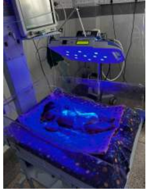
पोखरा स्वास्थ्य विज्ञान प्रतिष्ठानमा प्रदान गरिएको Radiant Warmer जडान पश्चात संचालनमा