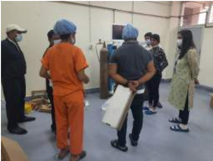
धौलागिरी अस्पताल बाग्लुङमा हस्तान्तरण गरिएको Laprascopic Machine संचालनको अवस्थाको बारे जानकारी लिँदै