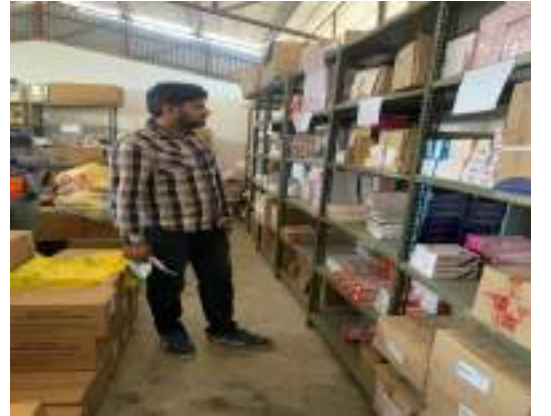
स्वास्थ्य कार्यालय तनहुँ स्टोर व्यवस्थापन सुपरिवेक्षण