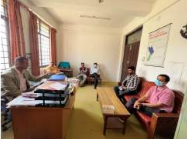
स्वास्थ्य कार्यालय तनहुँ सुपरिवेक्षण